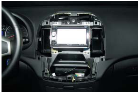
Insert new head unit.