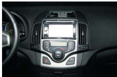
Put modified panel back in place.