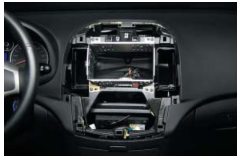
Insert metal bracket (Cage) into place as above.

Connect wiring harnesses as required, checking all connections before moving on to next stage of installation.