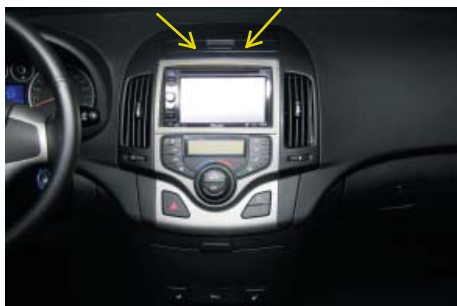
Replace storage panel and refix with screws. Put new head unit trim into place.